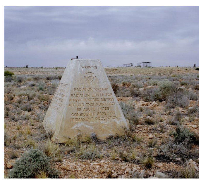
Figure 3: Taranaki Test Site, Maralinga, South Australia.

Weapons Tests Safety Committee (AWTSC)<sup>29</sup> insisted the test 'posed no hazard to persons nor damaged livestock or other property.'<sup>30</sup>