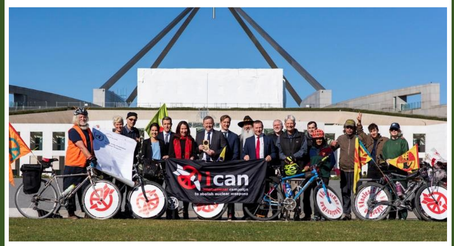
Figure 12: Australian activists from the International Campaign to Abolish Nuclear Weapons (ICAN) present a copy of the 2017 Treaty on the Prohibition of Nuclear Weapons to Australian Parliament in Canberra, following a 900km bike ride across the country.

Clinic of Harvard Law School has demonstrated that accession by US allies to the TPNW need not preclude or hinder existing non-nuclear defense cooperation.<sup>158</sup>