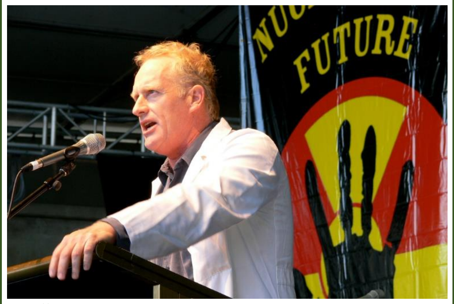
Figure 11: The late Bill Williams, co-founder of the International Campaign to Abolish Nuclear Weapons (ICAN).

While official Defence White Papers published since 1994 by the Australian government have made claim to END,<sup>154</sup> these claims are contested due to a notable ambiguity from the US government. There are no formal, transparent agreements open to public scrutiny in relation to the extension of US nuclear force to Australia. Debates around the origins, scope, reciprocal costs, and the credibility of END policies in Australia continue.