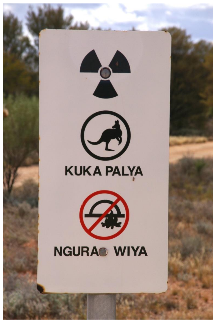
Figure 4: One of the hundreds of warning sings spread across the former nuclear test site at Maralinga.

Between 1966 and 1996, France conducted 179 nuclear weapons tests at Moruroa<sup>40</sup> Atoll (42 atmospheric; 137 underground) and 14 at Fangataufa Atoll (4 atmospheric;