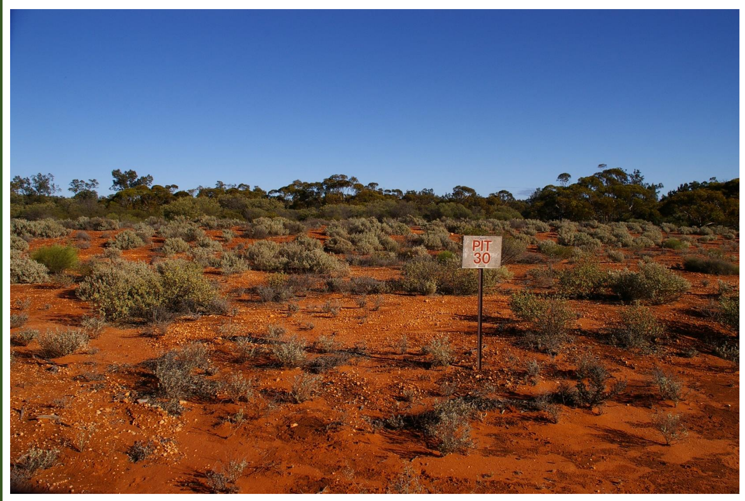
Figure 10: Faded and numbered waste pit signs such as this one can be found throughout the Maralinga test area, denoting a burial site and usually containing radioactive debris, often only meters deep.

hold 'at least 150 species of hard coral, more than 450 species of fish, more than 630 species of molluscs and 170 known species of sea stars, urchins and other echinoderms.' Multiple species of scientifically and ecologically important mangroves offer 'valuable nursery areas for juvenile fish and crustaceans and are stopover areas for rare and protected migratory wading birds,' according to the WA Department of Environment and Conservation. Dugong, whale, dolphin and turtle species are also recorded within the region. However, radiological contamination from the British nuclear tests still leads to advice for visitors to restrict their visits to the affected islands to one hour only per day and warnings to 'not disturb the soil in these areas and do not handle or remove